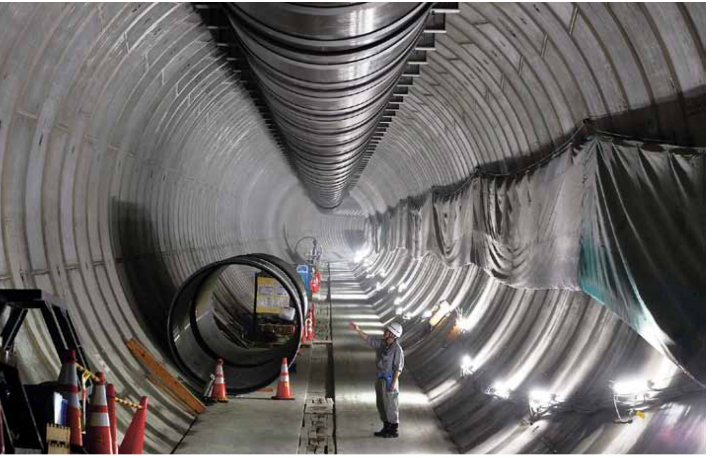
A worker points to the wall of a section of the Furukawa reservoir project being built in central Tokyo on Aug. 7. When completed in 2016, the 3.3-km-long subterranean reservoir will be able to hold 135,000 cu. meters of water, enough to fill 54 Olympic-sized wimming pools. BLOOMBERG

Sato: I did the program construction of the WECC and you can categorize it into nine wide tracks. Each track has a theme such as social infrastructure, how to create a resilient infrastructure, sustainable society, energy and so on. The contents cover many issues in industry and society, including engineering education, the issue of women in engineering and even the issues of patents. Each track is divided into six sessions, and the volume of one session is basically equivalent to one scientific conference. It means that there will be about 54 conferences held at WECC and those 54 conferences cover all the fields necessarv to create world engineering. I would like all young students, young engineers and the experienced engineers who lead them to participate in WECC 2015. Fruitful discussions should be carried out over issues such as the current level of engineering or problems facing modern engineering. I would like people to think about and discuss those issues in addition to broader issues such as how engineering develops in the future, or what engineering should look